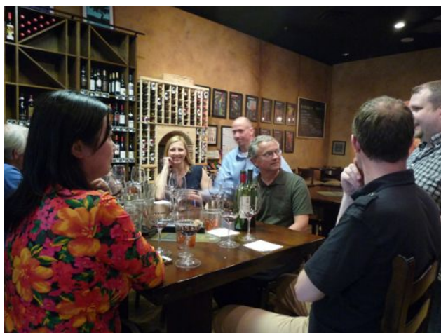
Old world or New World? Members finished conducting experiments to determine for themselves.