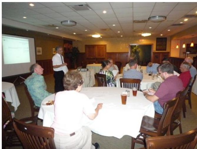
Presentation of the amended bylaws prior to the vote.